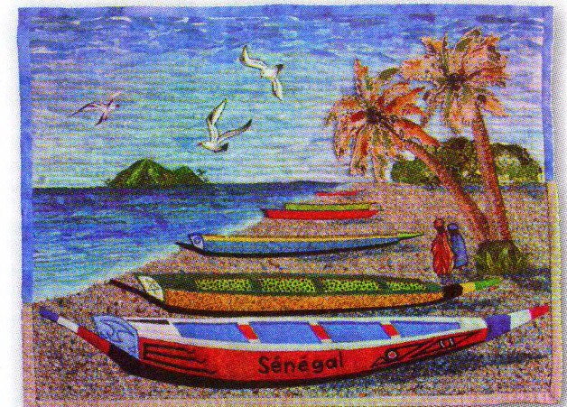
Senegal by Isabel Downs